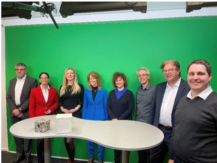
BIBM Communication Commission & the congress organising committee

The 24th BIBM Congress will take place in Amsterdam! From the 27th to the 29th of September 2023 the congress will be held in the Dutch capital – the “Venice of the North”. The congress will be under the slogan: ‘Green | Digital | Resilient | Precast Concrete Solutions’ . Be part of the next BIBM Congress 2023 as exhibitor, congress participant or sponsor and meet potential partners and speakers from Europe and beyond!