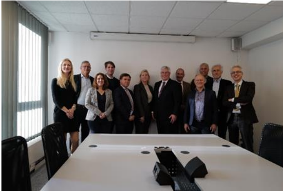
Concrete Europe Team